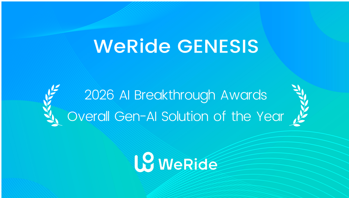
WeRide GENESIS has won "Overall Gen-AI Solution of the Year" at the 2026 AI Breakthrough Awards