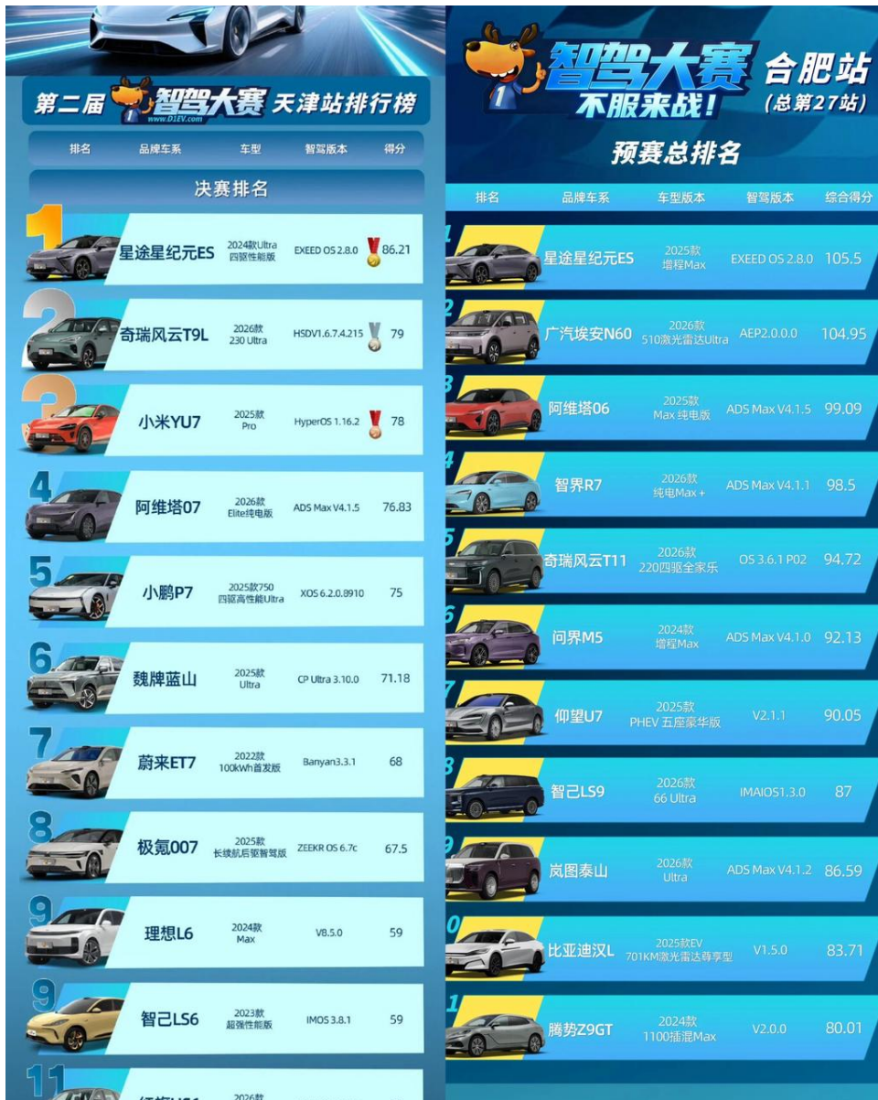
Left: Tianjin Final (Round 6) rankings — WRD 3.0-powered Chery Exeed Sterra ES ranked No.1 Right: Hefei Round (Round 5) preliminary rankings — WRD 3.0-powered Chery Exeed Sterra ES and GAC Aion N60 ranked top two

To date, WRD 3.0 has secured mass-production design wins across more than 30 vehicle models with leading OEMs including Chery and GAC Group. As these programs advance, the capabilities of WeRide GENESIS are rapidly translating into product competitiveness for the passenger vehicle market.