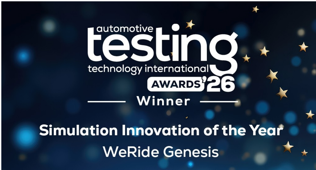
Following the 2026 Automotive Testing Technology International (ATTI) Awards on June 24

While generative AI has transformed digital content creation, the next major opportunity lies in applying AI to real-world physical environments. To operate in real-world environments, AI systems must understand physical laws, causal relationships, and spatiotemporal dynamics , enabling them to take actions that are safe, stable, and executable. As a result, Physical AI is emerging as the next frontier of artificial intelligence.